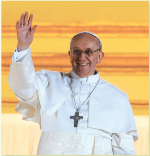
MAY THE LORD BLESS AND GUIDE OUR NEWLY ELECTED POPE FRANCIS