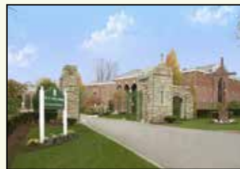
Entrance at Mt. St. Mary Cemetery

Mount St. Mary Cemetery, Flushing, Queens was established