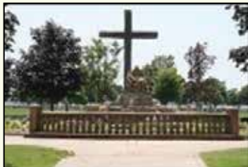
St. Charles/Resurrection Cemeteries – The Pieta

St. Charles/Resurrection Cemeteries, Farmingdale, Long