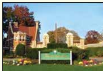
Entrance at St. John Cemetery

St. John Cemetery, Middle Village, Queens was established