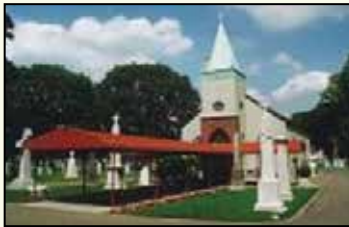
Holy Cross Cemetery – Chapel

Holy Cross Cemetery, Brooklyn was established and