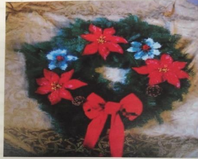
Option B. – Christmas Wreath (24" diameter)