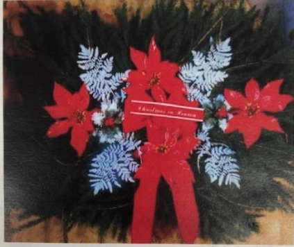
Option A. – Christmas Pillow (24" X 36")