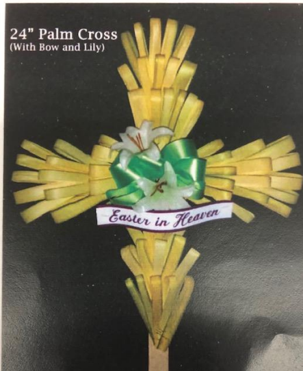
24" Palm Cross (With Bow and Lily)